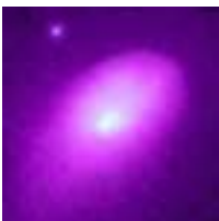
Chandra image of the galaxy cluster Abell 2142 in X rays.

Chandra images provide dramatic evidence of these mega-mergers. Cosmic "weather systems" millions of light years across are observed, as relatively cool 50 million degree Celsius clouds of gas fall into much larger and hotter clouds.